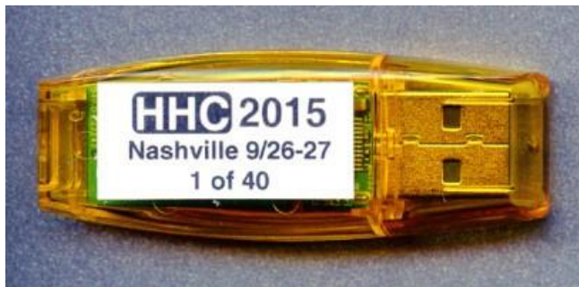
Fig. 2 – USB HHC 2015 Conference Drive.

Note: The USB 2015 Conference Drives have an orange label on the back. The upper number is the write speed and the lower number is the read speed in Mega Bytes per second. The drives were not all the same which is typical of Cheap Chinese made products.